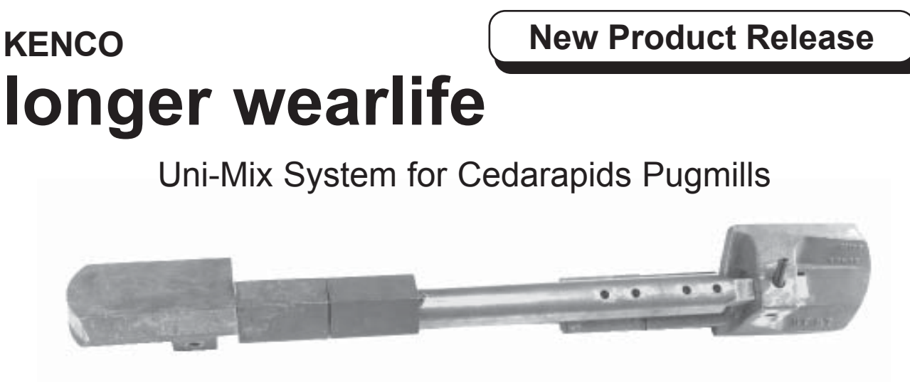
Replace worn pugmill mixer tips in less than 5 minutes!

KENCO Uni-Mix has achieved widespread popularity among operators of asphalt plants with square shaft pugmill mixing systems. Now the same benefits of the Uni-Mix System are available for Cedarapids pugmill plants. Just install the one-time conversion shaft and from then on, replace worn tips in less than 5 minutes.