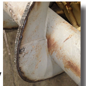
Tungsten Carbide Impregnated directly into auger flights