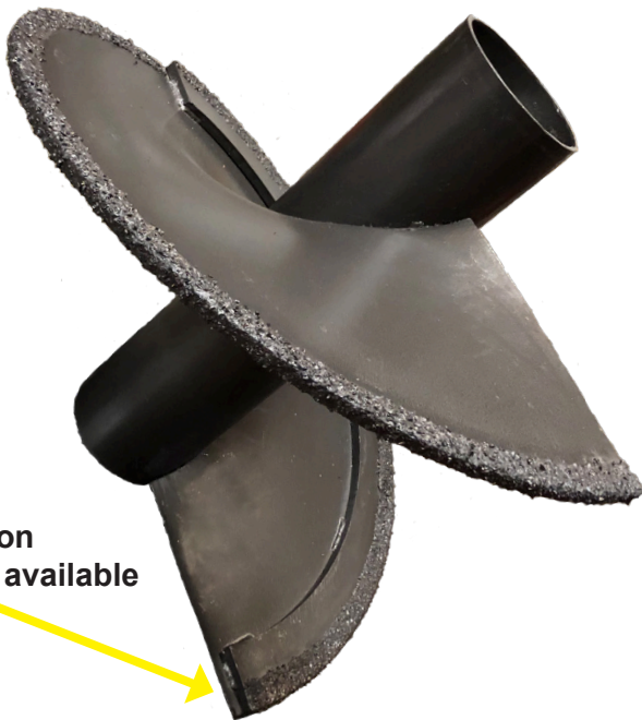
Repair ribbon flights also available