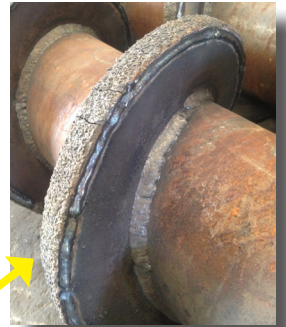
Weld-on TCI Wear Strips

Alternatively, tungsten carbide wear strips featuring the Kenco TCI process can be welded to flight edges and any other drill tooling needing superior protection. Tungsten carbide is one of the toughest metals known to science. Second only to industrial diamonds, it has a hardness exceeding 90 Rockwell A.