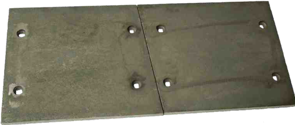
Kenco part # K-1519-34-SL

Tired of breaking your slat chain to replace broken liner plates?