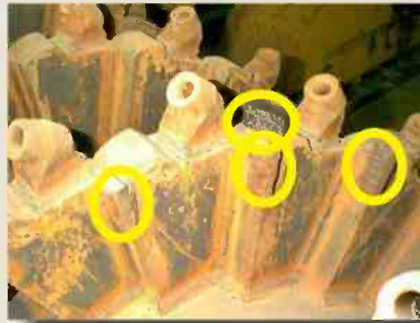
Tooth Holder Protector